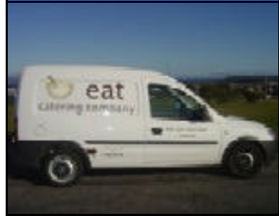
Eat Catering set up for out-catering in Taupo