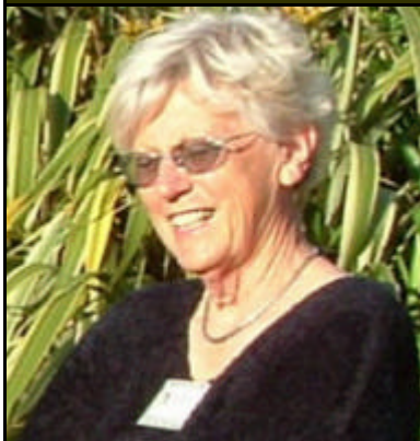
Taupo Winetasters' Club Member