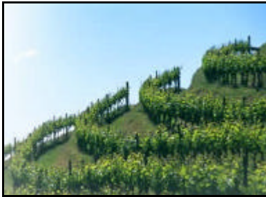
The Terrace Vineyard on the hillside beside the Esk Valley Estate winery at Bayview.